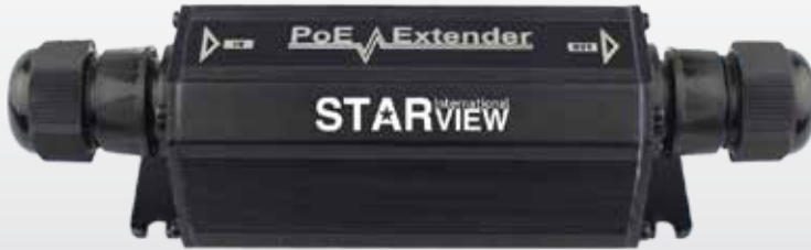
Outdoor use weather-proof Single port PoE extender