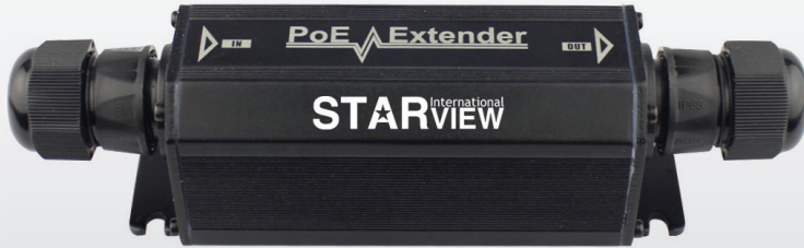
Outdoor use weather-proof Single port PoE extender